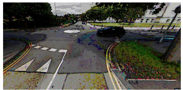
Example of a raised plateau on a roundabout